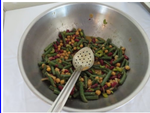
Not 2 or 1, it's 3 bean salad