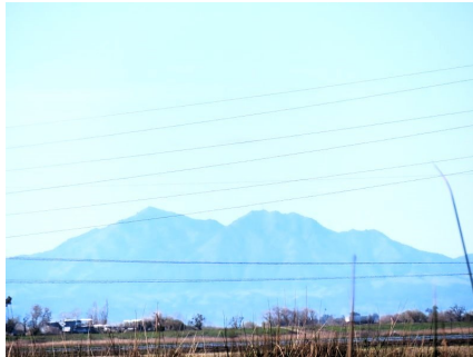
The Sleeping Lady, or Mt Diablo